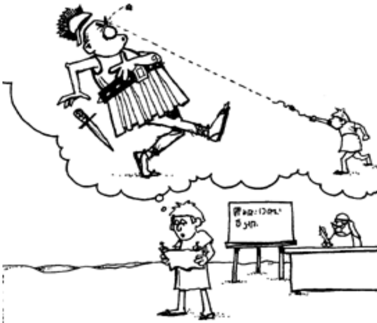
"How I Spent My Summer Vacation"